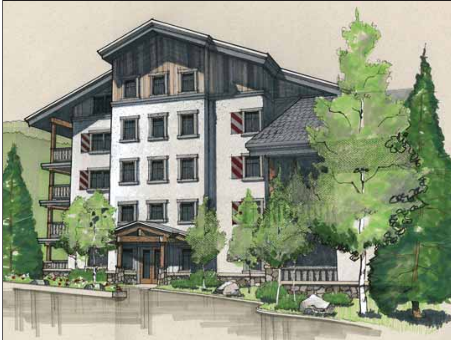
RENDERINGS COURTESY OF FRITZLEN PIERCE ARCHITECTS

Here is just a smattering of the improvements, both completed and under construction, in one of the top resort communities in the world. And beyond the new and updated structures, Vail Village and its surrounding enclaves are sprucing up, cleaning up and updating to make wandering around a pleasure. On-mountain upgrades are also being made, including new high-speed quad chairlifts. Stay tuned as we continue to report on the reinvention of Vail. We'll bring you more information about the public spaces and skier amenities that are making Vail the new standard for high-country resorts. For more information visit newvail.com or futurevail.com ■