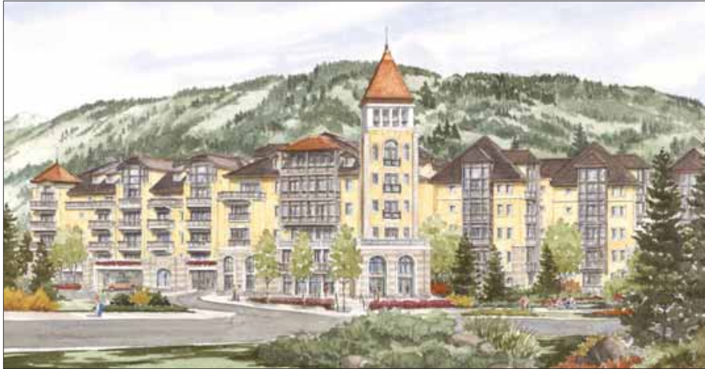
Courtesy of RCR Vail. This artist rendering is provided for illustrative and marketing purposes only and should not be relied upon as a basis for purchasing since all elements are subject to change or refinement without notice. Finish details should be verified before purchasing.

New real estate developments are a large part of Vail's renewal, as baby boomers, retirees and even young families continue to seek the quiet, slower pace of the high country and a place for several generations to gather.